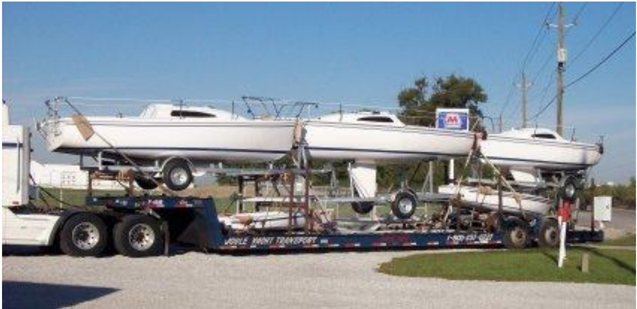
Catalina 22 Sport (#15639), Capri 22 and Capri 18 arrive at Catalina Yachts dealer Sailboats, Inc. of Indiana.