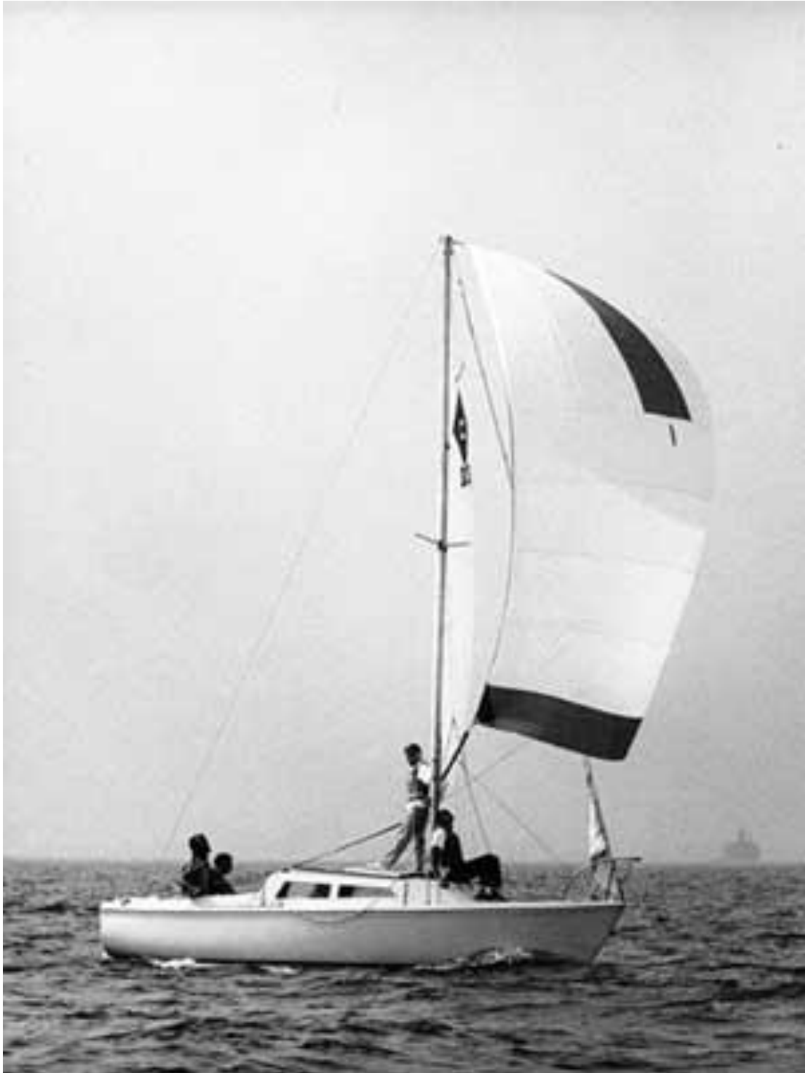
The above photograph shows Beattie Purcell skippering hull #1 at the “One of a Kind Regatta” in the early 1970s on Lake Michigan. The photo was obtained from the article “Catalina Yachts: One Big Family” by Steve Mitchell and printed in Good Old Boat magazine (Volume 4, Number 1) in January/February 2001.