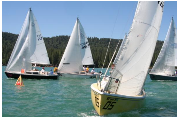
2006 Catalina 22 National Regatta at Scotts Flat Lake, California.

Each year, members of the Catalina 22 National Sailing Association vote for the host fleet/club of the following year's National Championship Regatta. The C22NSA member who represents the elected fleet/club serves as Vice Commodore on the C22NSA Board of Directors.