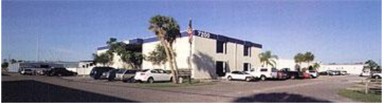
Catalina Yachts – Largo, Florida Office and Manufacturing Plant – this is where Catalina 22s are built today beginning with the 2010 model year.

Catalina Yachts has a bright future given the thousands of loyal customers sailing its products around the world. The international class associations for the C-22, C-25, C-27 and C-30 are among the largest sailboat groups in the world.