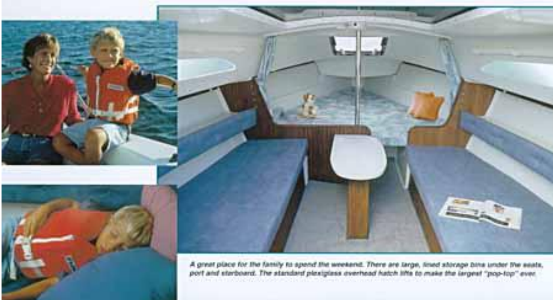
A great place for the family to spend the weekend. There are large, lined storage bins under the seats, port and starboard. The standard plexiglass overhead hatch lifts to make the largest "pop-top" ever.