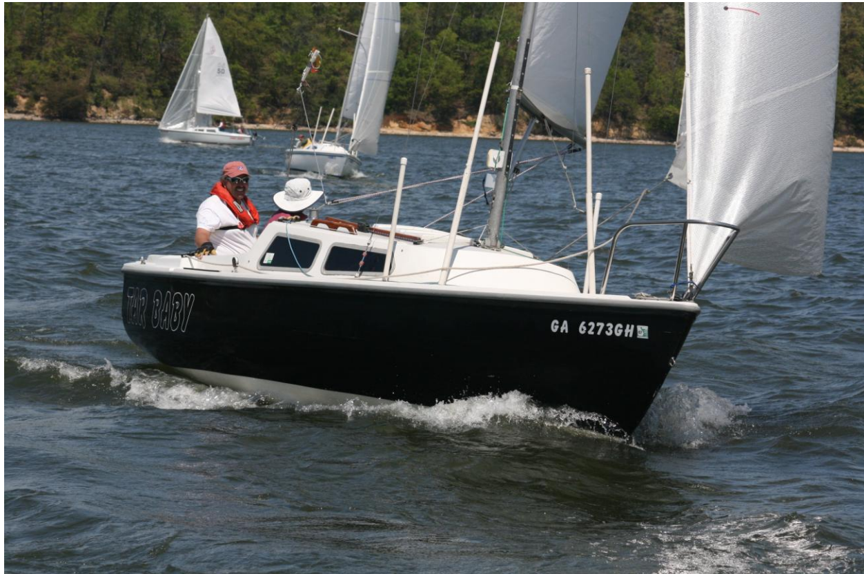
Pam and Dennis Slaton sailing "Tar Baby" (#27) at the 2008 Chattanooga Challenge.

"I think our fleet 'rocks'. We are not the largest fleet, but we are one of the most active. We have a very stable core group that is there year in year out, we are more than fleet members, and we are friends. We share tips; we help each other in everything related to our boats."