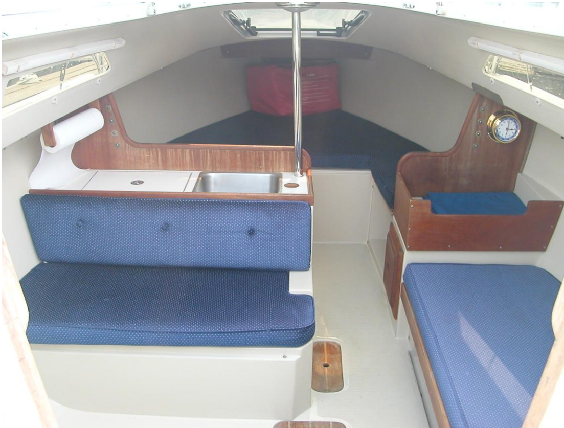
Interior view of a Catalina 22 "New Design" model. Hull #14411.

As a racing boat, the "New Design" model was identified as heavier than the original Catalina 22 and discouraged most racers from purchasing the boat.