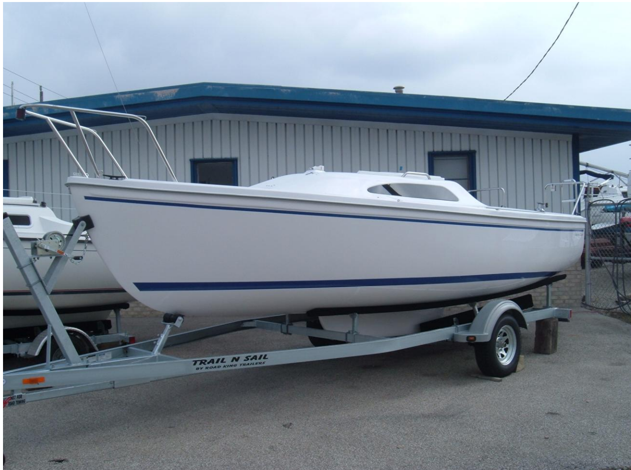
Sport hull number 15747 on display at Sailboats Inc in Indianapolis, Indiana.

When first viewing the Catalina 22 Sport, it is easy to mistake the boat for a Capri 22. The Catalina 22 Sport is built from a nearly identical hull mold as the original Catalina 22. However, the deck, cabin trunk, and interior are nearly identical to the Capri 22 MkII.