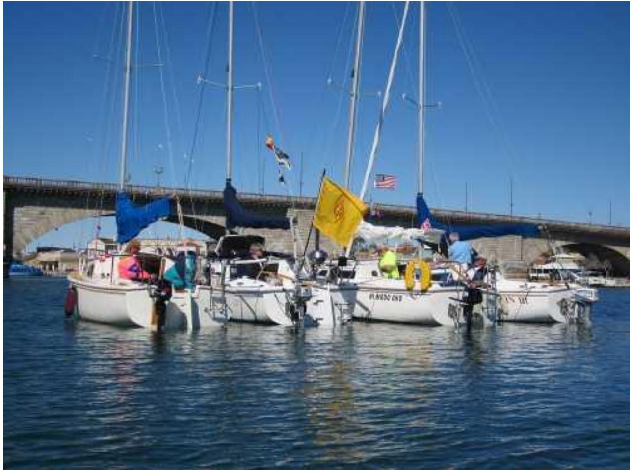
Catalina 22 sailors rafted-up at the 2013 Havasu Pocket Cruiser Convention.

Today, there are over 140 Catalina 22 Cruising Club members.