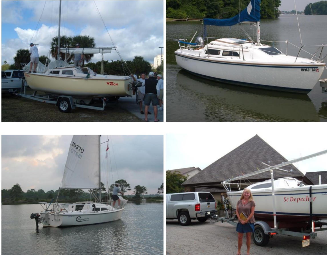
Original C22 (top left), C22 New Design (top right), C22 MkII (lower left), C22 Sport (lower right).

four of the five Hall of Fame inductees are still in production, a testament to their enduring appeal. The Catalina 22 is one of those five boats selected.