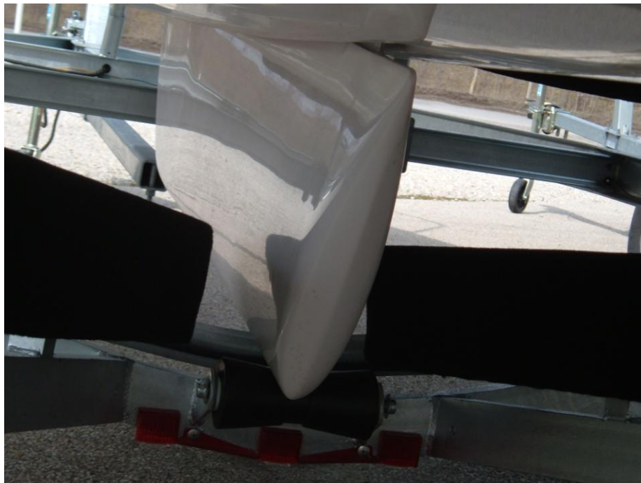
Fiberglass encased keel - same keel used on MkII and Sports.

The MkII was the first model to feature a fiberglass encased keel. This new feature greatly eliminated reduced keel maintenance.