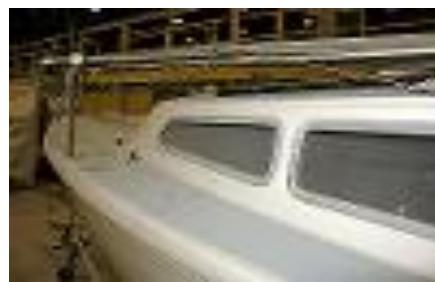
Catalina 22 Hull #1 at the Catalina 22 Woodland Hills factory.

Catalina Yachts was formed in 1970 and the first model built by Catalina Yachts was the 22 foot design previously rejected by Whittaker Corporation. The Catalina 22 went on to become the best selling keelboat of all-time with over 15,500 boats over 40 continuous year of production.