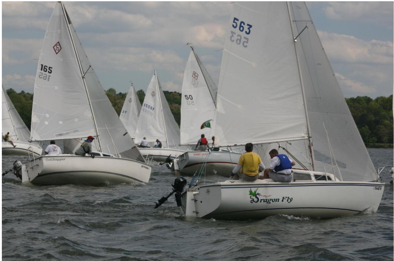
A competitive start at the 2008 Chattanooga Challenge.

high winds. This incident began the search for a tuning guide to solve this problem. The final solution was to change the wire to 1/8", the same as the uppers, and to replace the aluminum spreader brackets with stainless steel spreader brackets. Eventually a new mast extrusion was developed which gave the mast more rigidity. These changes eliminated the problem of mast pump and failure.