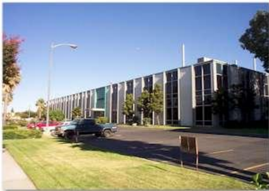
Catalina Yachts Office Building – Woodland Hills, California, where thousands of Catalina 22s were built until 2010.