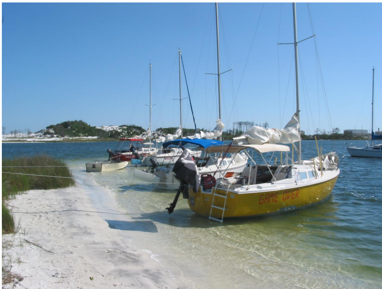
Catalina 22 Northern Gulf Coast Cruise – Spectre Island.

The NGCC accepts the owners of all Catalina 22 sailboats wishing to participate. It is a week-long cruise starting at Fort Walton Yacht Club. The typical cruise travels 150 miles through the ICW and the Gulf of Mexico (weather permitting for small boats) from Fort Walton Beach to Wolf Bay Lodge, Alabama. Anchorages include Spectre Island, a small island in the ICW that is ideal for campfires; Quietwater Beach, where members of the Pensacola Beach Yacht Club have shown the NGCC Fleet the ultimate in southern hospitality; Fort McRae in Big Lagoon, a beautiful beach anchorage overlooking Pensacola Pass; and finally the serene quiet of upper Wolf Bay surrounded by tall pines and waterfront homes. The course is then retraced back to the Fort Walton Yacht Club. In 2005, the Cruise was fortunate to have the executive editor of Sail Magazine participate and write a feature story on the cruise in its August 2005 issue. For additional information on the NGCC, go to: http://c22fleet77.googlepages.com/ .