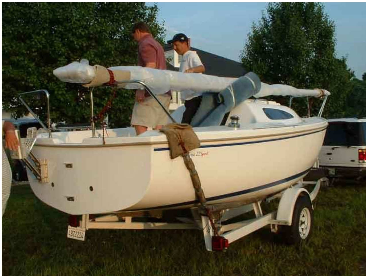
The first Catalina 22 Sport, hull number 15540, arrives at Lake Lanier immediately following the 2006 Catalina 22 National Championship Regatta.