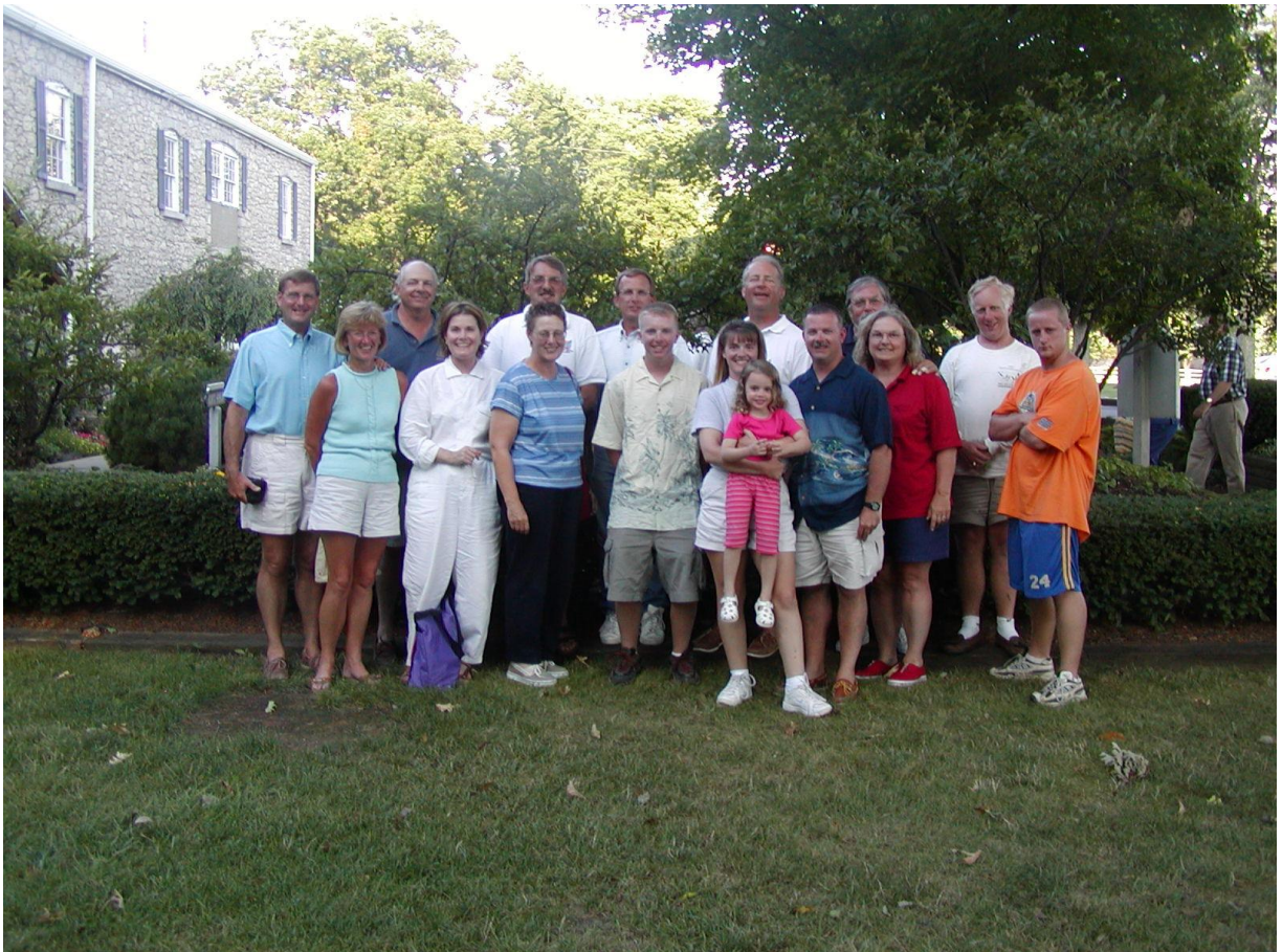
The 2002 Catalina 22 Great Lakes Cruise attracted families from across the Midwest.