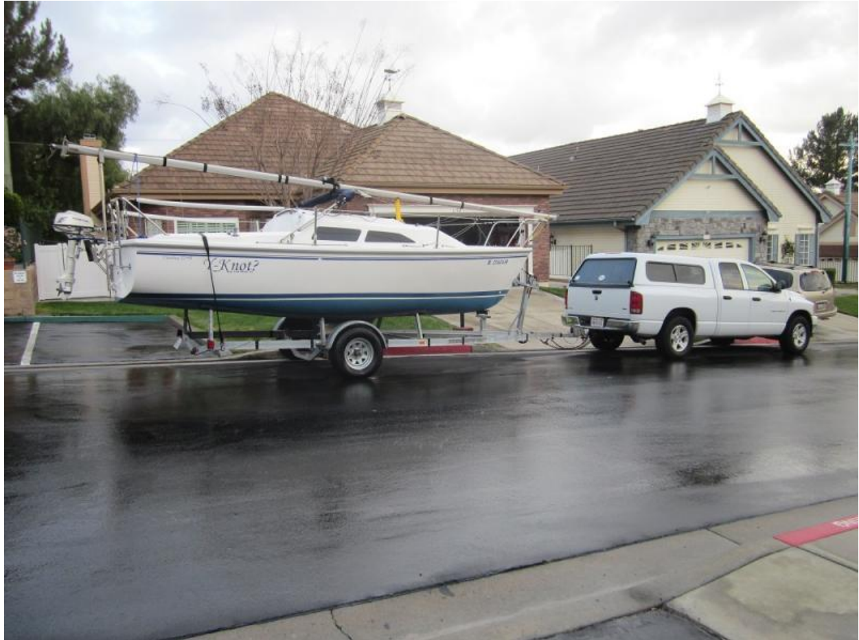
Catalina 22 MkII belong to C22NSA Commodore Don Boyko getting ready for the 2013 Sail Havasu Pocket Cruiser Convention.

In January 1995, Catalina Yachts introduced the Catalina 22 MkII beginning with hull number 15348. It was also designed to be lighter than the "New Design" model so that it could better compete with the older boats at Catalina 22 regattas. The most striking and differentiating design characteristic of the MkII was its 8 inch wider beam at the deck than previous models. The 8 inches of additional beam provided the MkII with a very generous amount of increased room below.