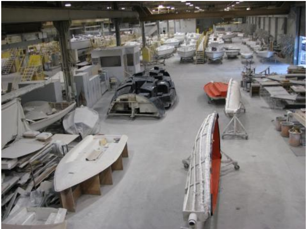
Inside look at Catalina Yachts with Catalina 22s at the top right of the photo.