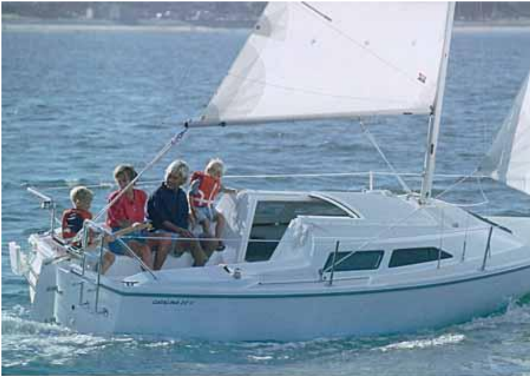
Fast, safe, and handsome. The Catalina 22mkII continues to meet the needs of today's sailing family. Over 15,000 owners have made the Catalina 22 the n