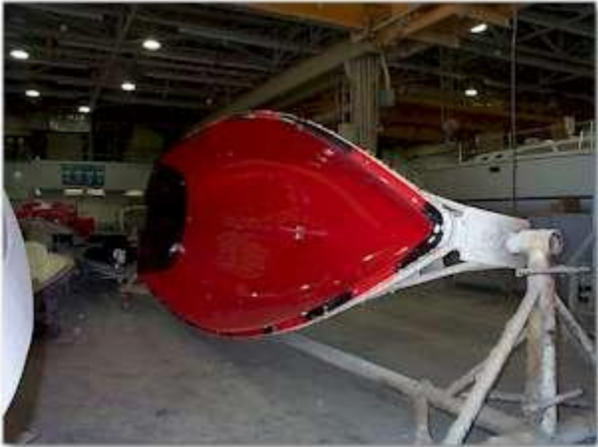
Hull mold of a Catalina 22 MkII.