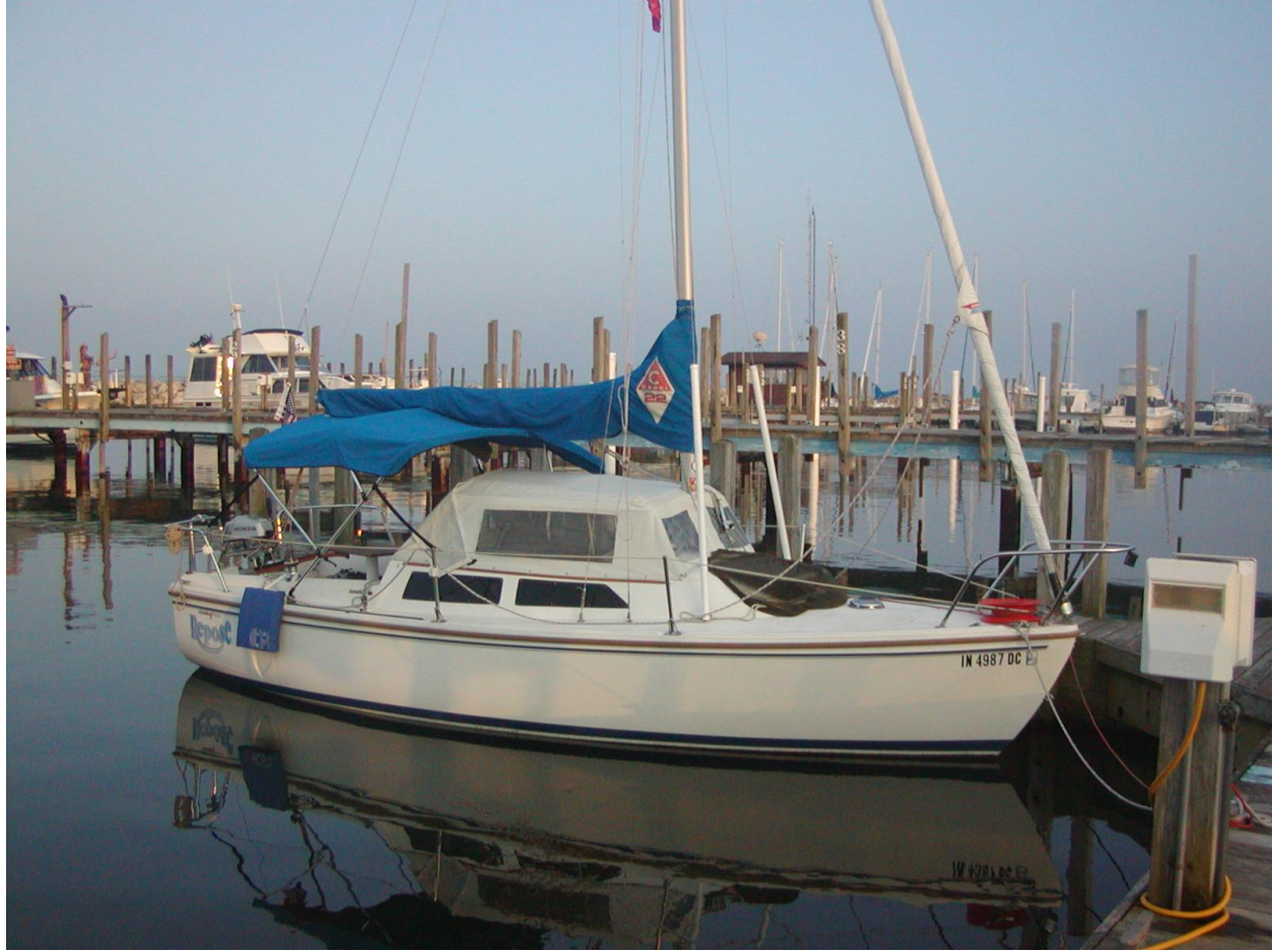
Exterior view of a Catalina 22 “New Design” model. Hull #14949.

After 15 years of continuous production, Catalina Yachts gave the Catalina 22 a face-lift with the 1986 model year. The Class refers to the 1986-1994 Catalina 22 as the “New Design” model.